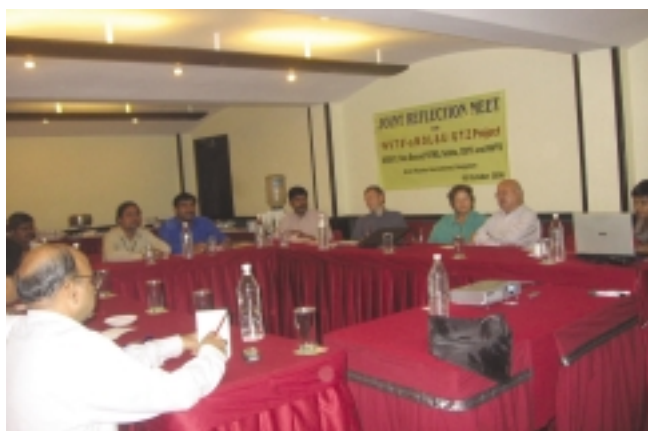
Joint Reflection session at Bangalore