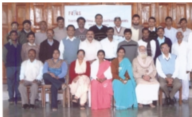
Participants of the Patna Training Programme