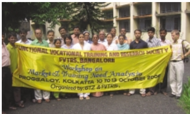
Participants of the Kolkata Training Programme

FVTRS conducted two training programmes on, 'Market and Training Needs Analysis', the first one at Kolkata from 10 to 13 October and the second at Patna from 5 to 8 December 2006. These workshops were conducted as part of the strategic partnership with GTZ/NVTS for building capacities of partners in the ongoing projects and for prospective partners. The core content of these workshops dealt making proper analysis of needs, identifying opportunities and challenges and understanding the target group for designing effective training interventions in partnership with them for the desired impact.